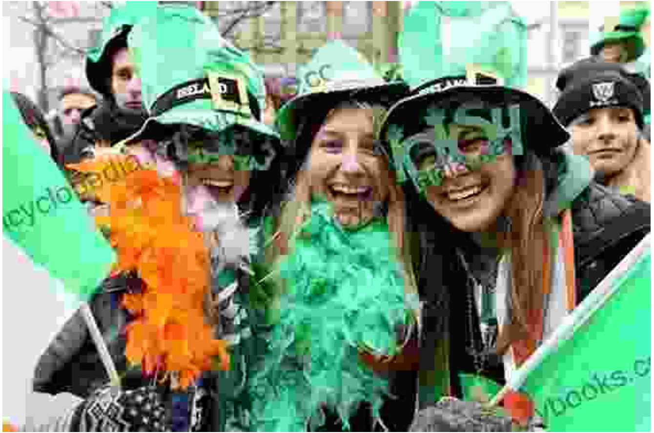
People wearing green on St Patrick's Day