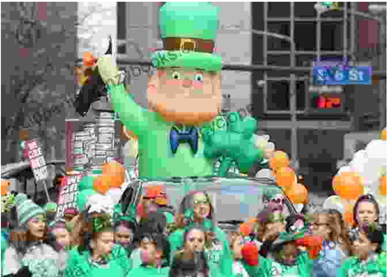
A St Patrick's Day parade

Here are some photos of St Patrick's Day celebrations around the world: